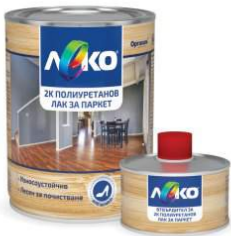
Packages: 650ml + hardener 325ml