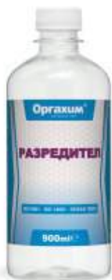
Packages: 450ml; 900ml

Dilution up to working viscosity of lacquer and paint materials on a base of alkyd resins.