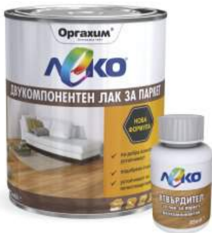
Packages: 650ml + hardener 85ml